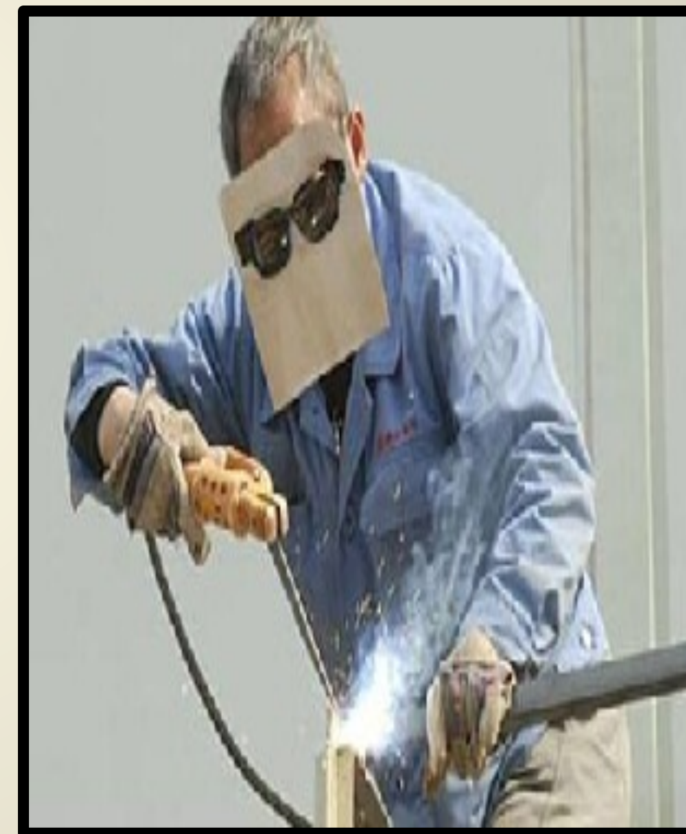
Unsafe Welding Practices