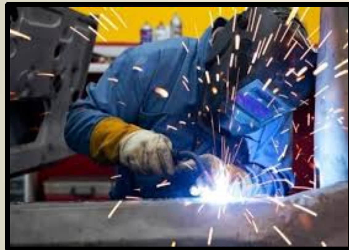
Safe Welding Practices