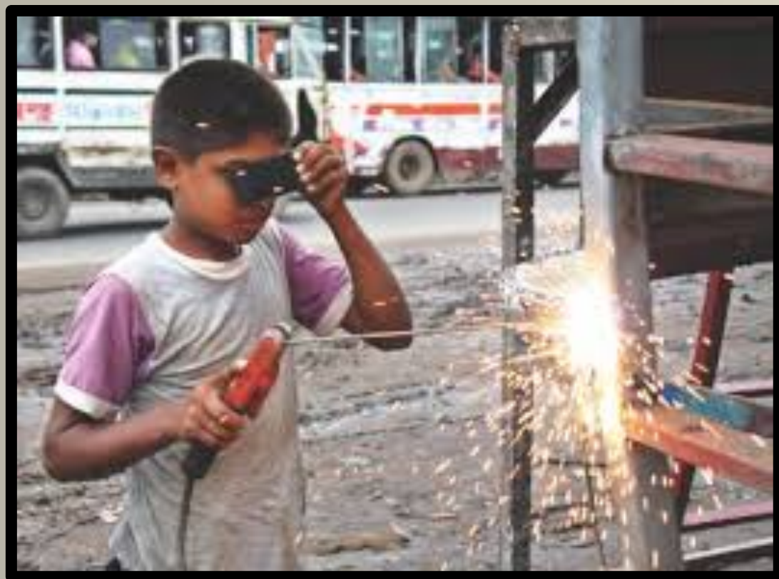
Unsafe Welding Practices